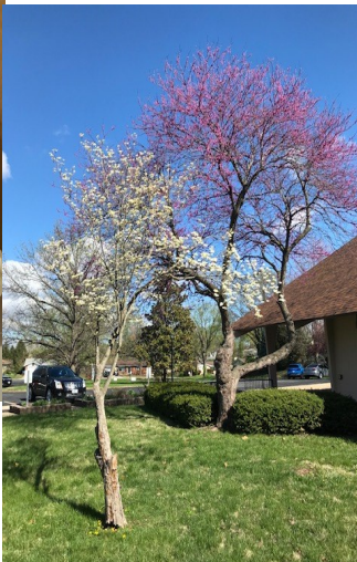
Two of Trinity's trees, a dogwood and a redbud, have definitely seen better, healthier days. And yet, here they are, heralding spring. ....dying, and behold we live.