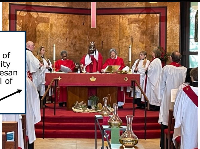
Good Friday "The Pasion Story in Word, Choral Music, Drama, and Hymns"